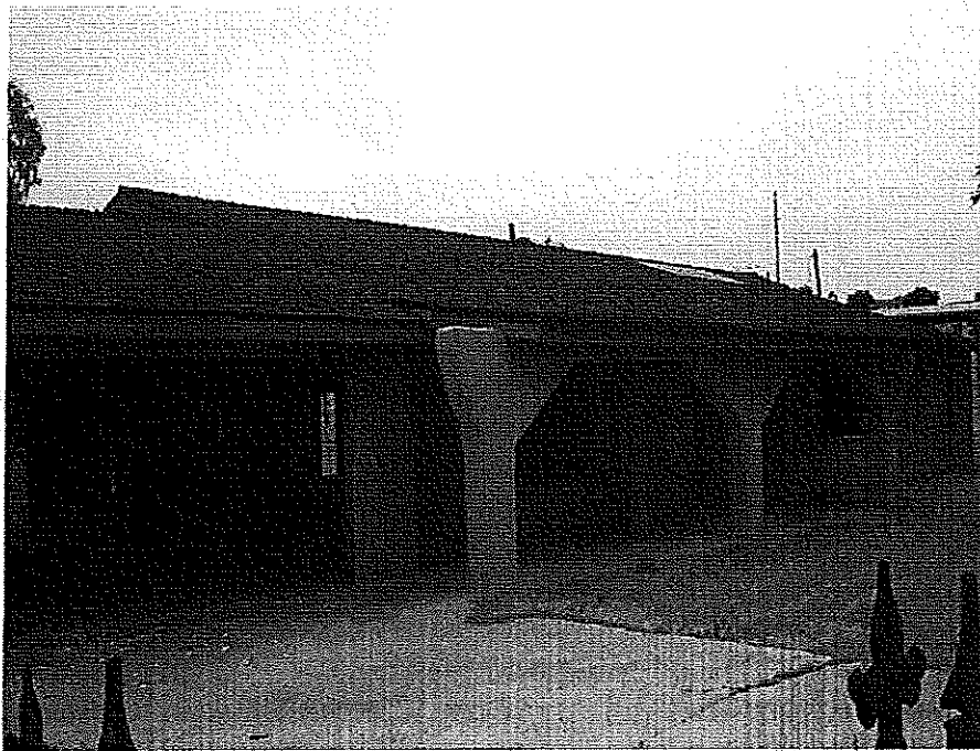
Photograph 1- illustrates the front exterior of the unpermitted structure at 22581 Martin Street, Perris.