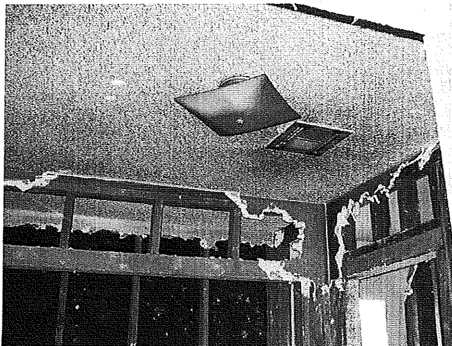
Photograph 2- illustrates the interior of the master bedroom walk-in closet in the home at 22581 Martin Street, Perris.