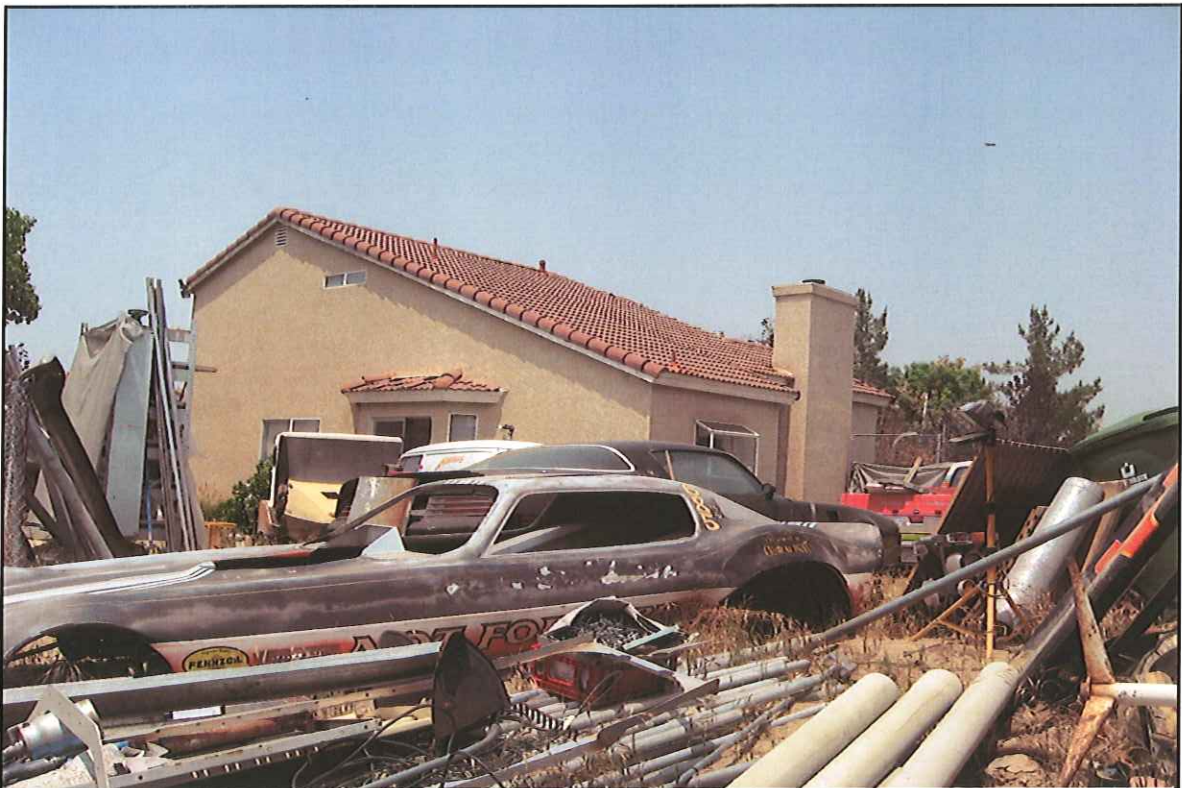
PHOTO # 6 NOTES: Inoperable vehicles, metal, construction material, tools