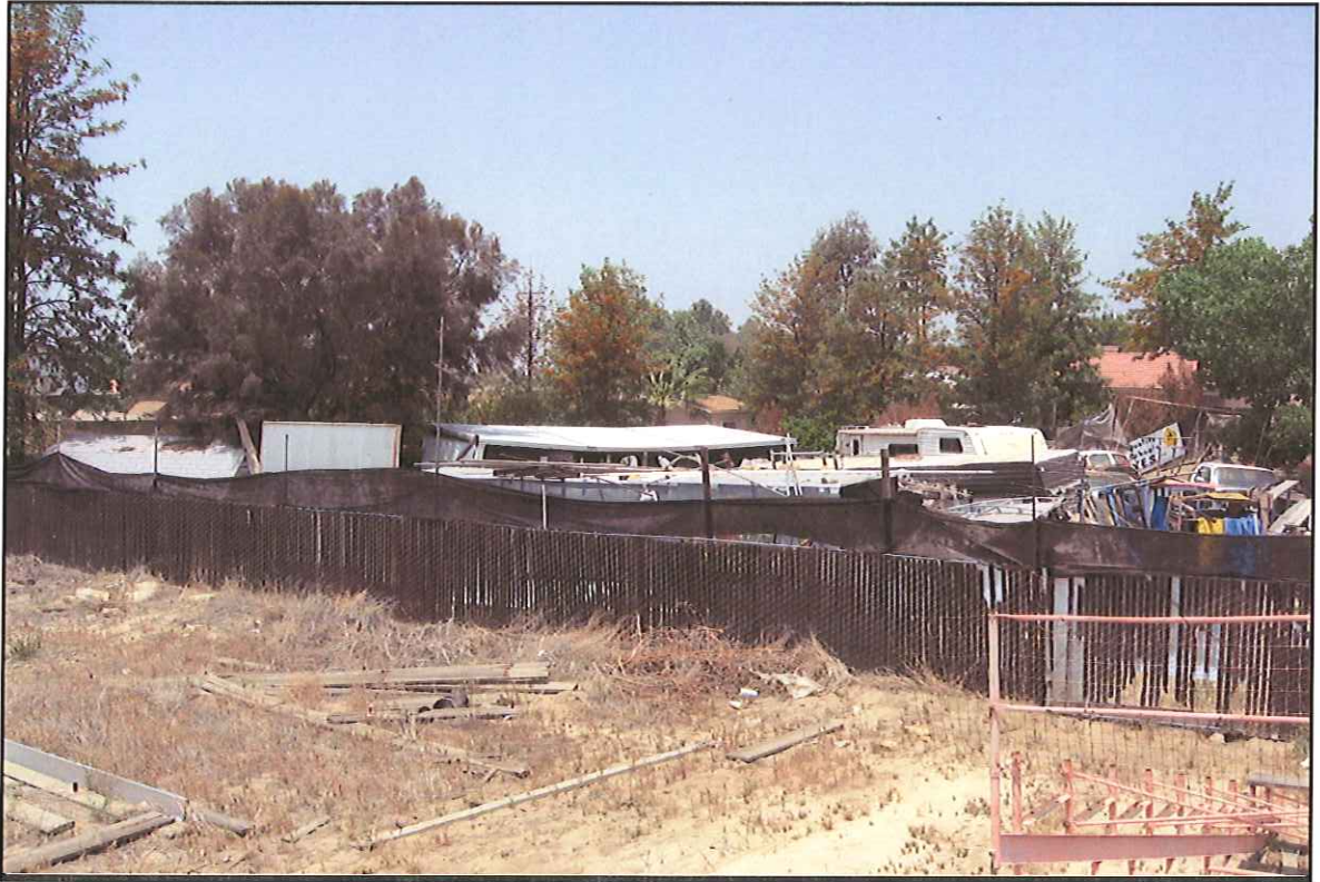
PHOTO # 7 NOTES: View rear of the property with RVS x2 and shedsx3, inoperable vehicles and debris.