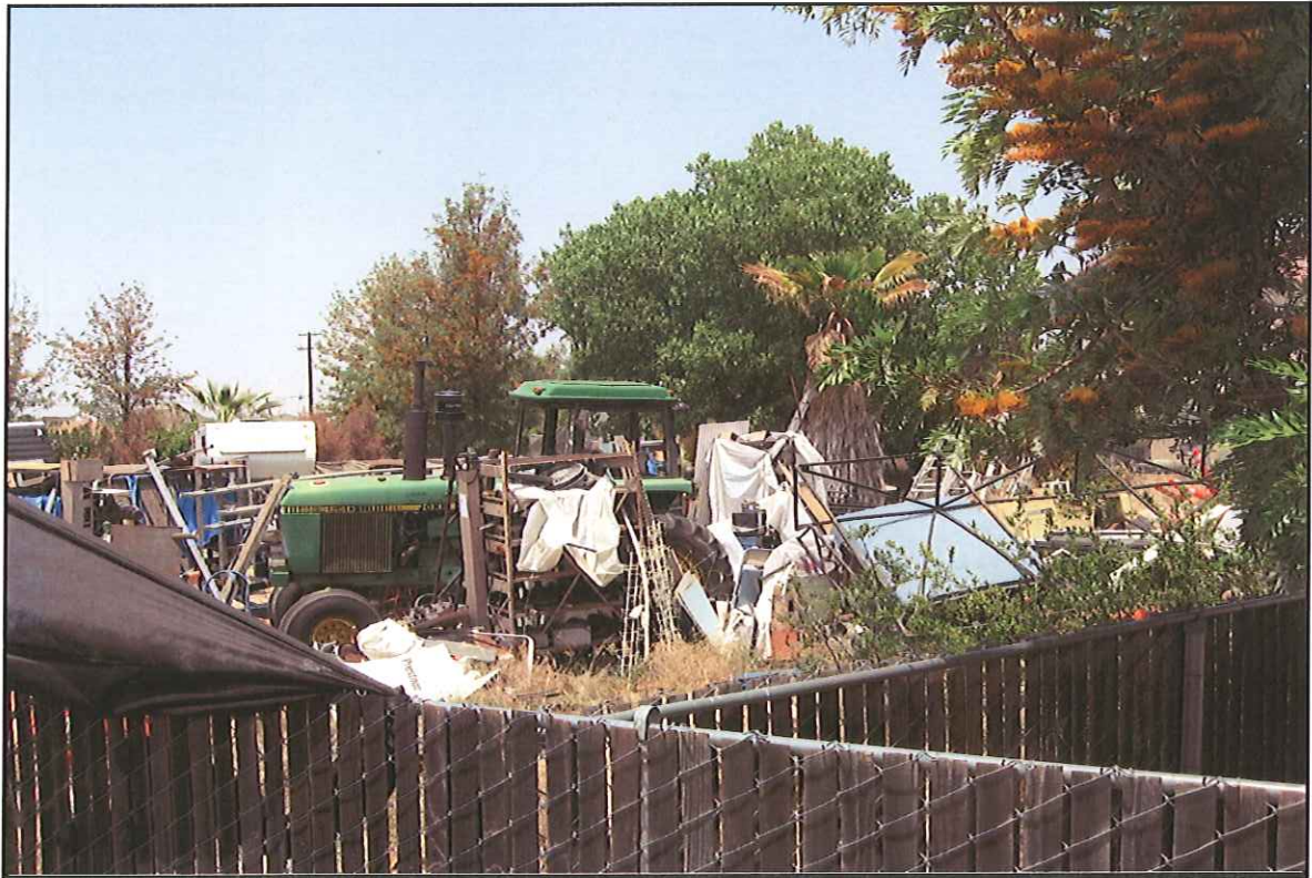
PHOTO # 3 NOTES: View of excessive outside storage from the rear of the property. With Tractor , Vehicle batteries, and debris