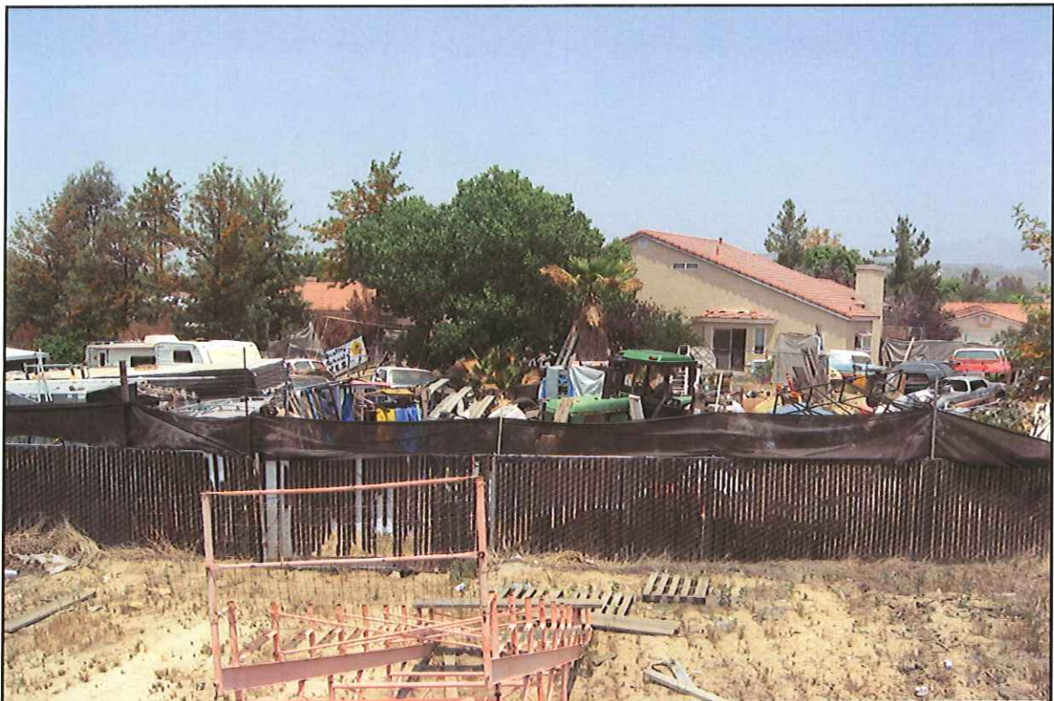
PHOTO # 2 NOTES: View from the rear of 25097 Jutland Dr. Hemet Ca. 92544 with Violation of excessive out side storage.