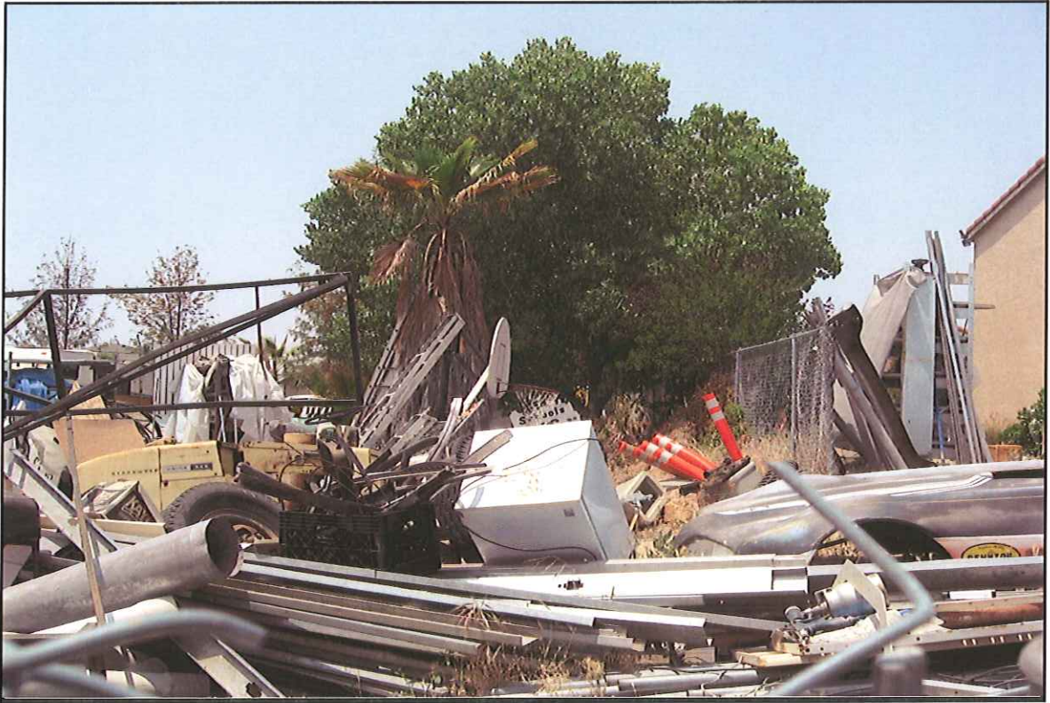
PHOTO # 5 NOTES: Stored Metal, appliances, road cones, auto frames, tires, old signs and vehicles.