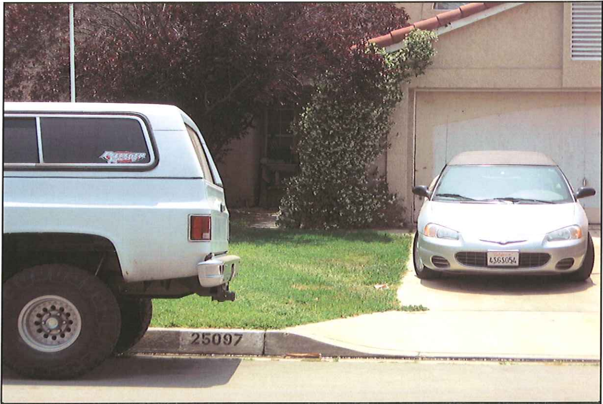
PHOTO # 1 NOTES: View of 25097 Jutland Dr. Hemet Ca.92544 with violation of Excessive outside Storage.