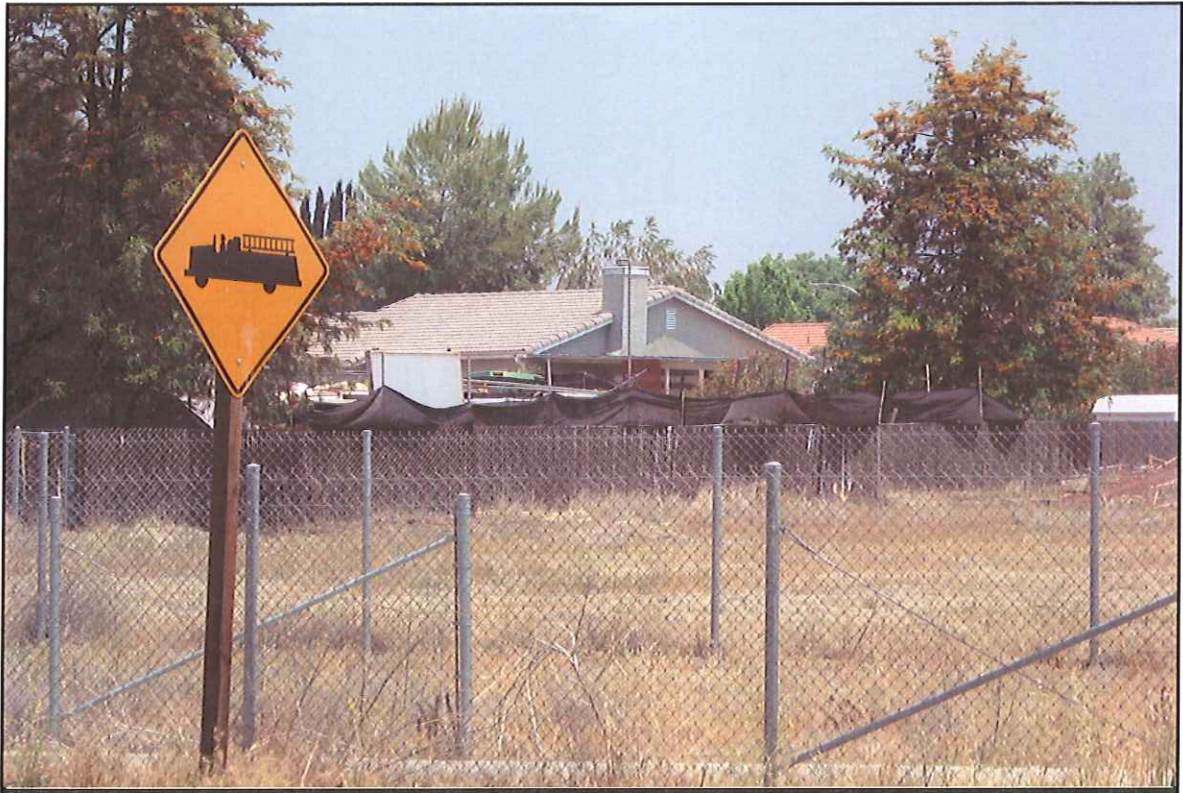
PHOTO # 9 NOTES: View of the property from Fairview Ave. it has become a public nuisance.