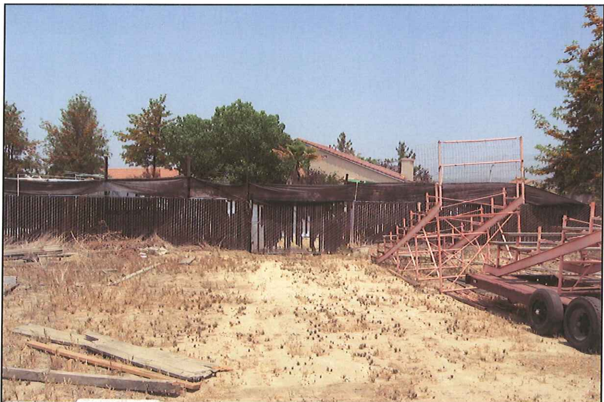
PHOTO # 8 NOTES: View of rear entrance to the property made in the fence for access through adjacent property.