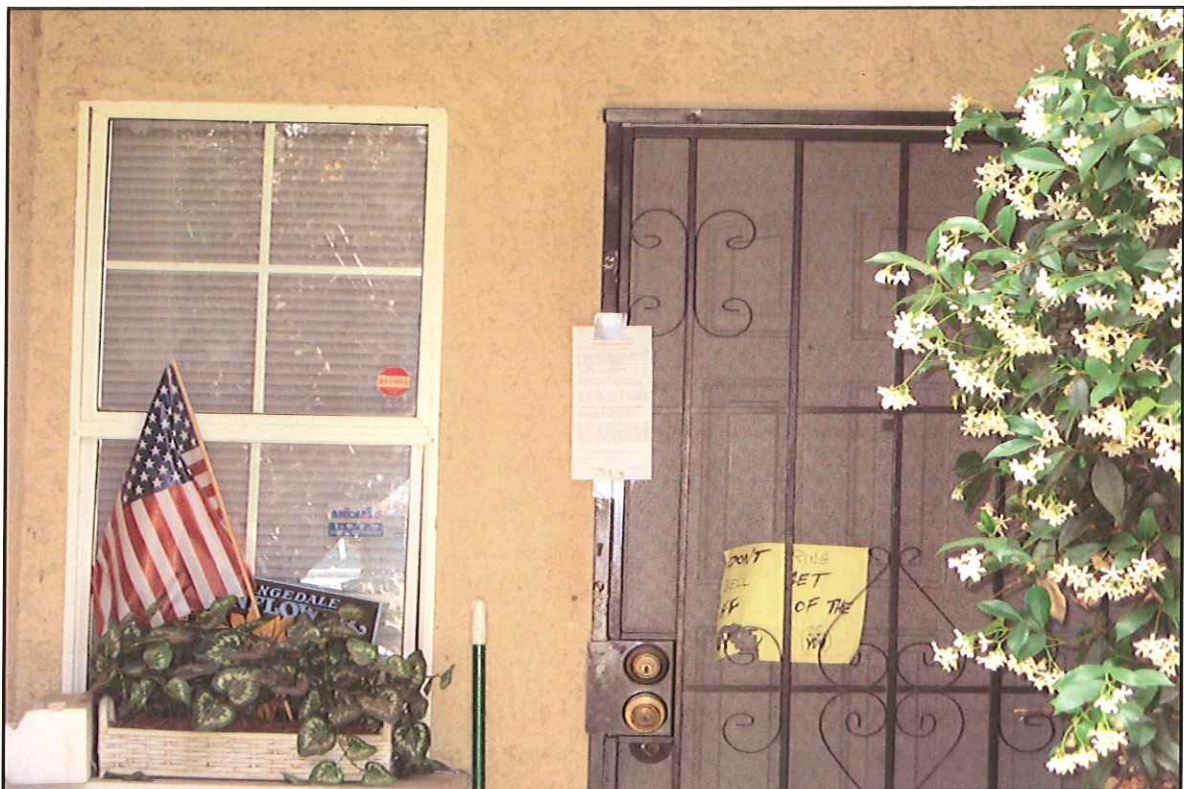
PHOTO # 10 NOTES: Posting; Notice of violation for Excessive outside storage.