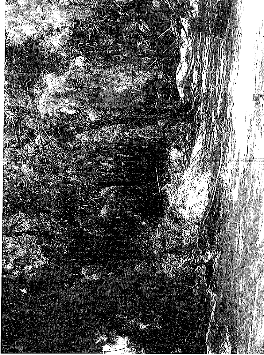
Case# CV- 1006539 APN: 666-201-019 Photos Taken 05/09/2011 Location: 17077 Covey St. N. Palm Springs Violation: Accumulated Rubbish