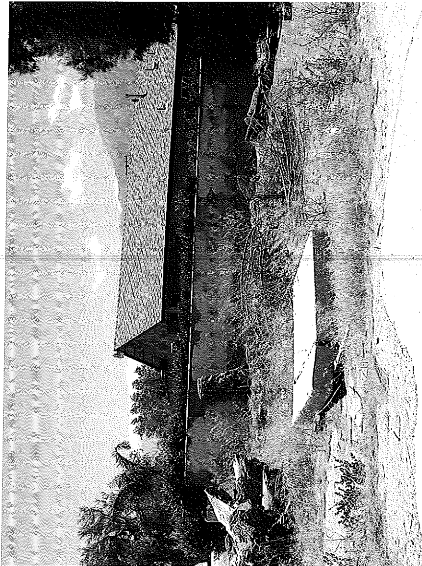
Case# CV- 1006539 APN: 666-201-019 Photos Taken 05/09/2011 Location: 17077 Covey St. N. Palm Springs Violation: Accumulated Rubbish