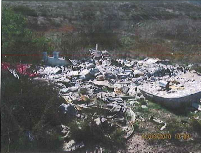
1 110310 TMcMullen