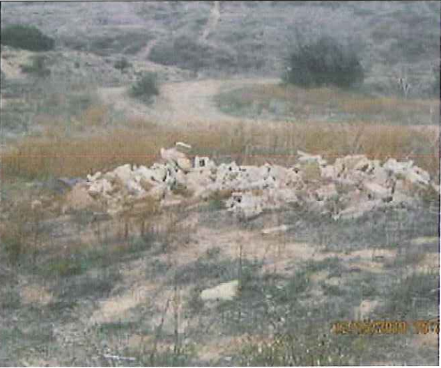
Additional refuse pile. JCRUZ