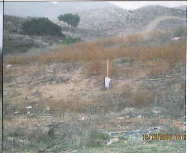
Posting on property. JCRUZ