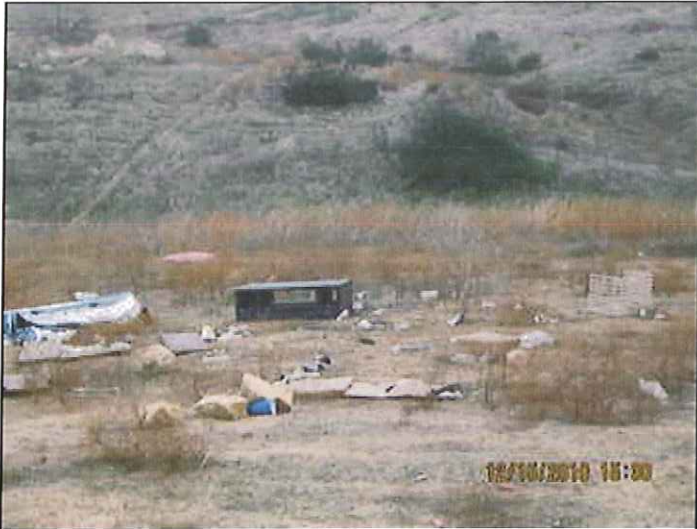
Trash pile #2. JCRUZ