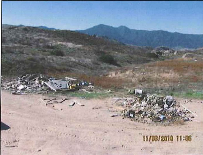
3 110310 TMcMullen