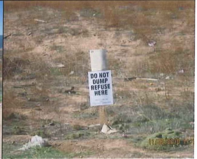
4 110310 TMcMullen