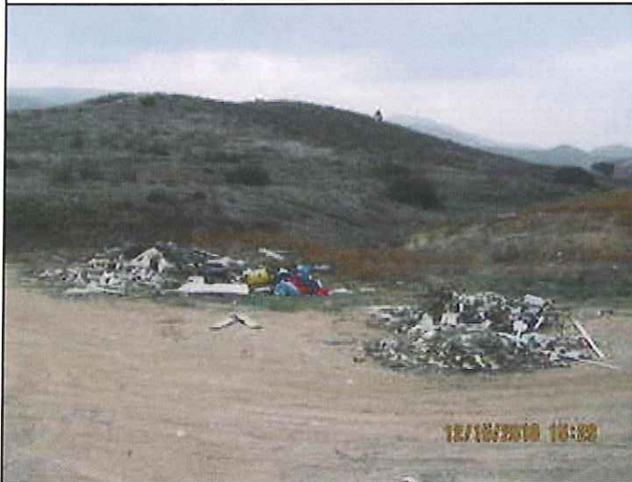
Trash pile #3. JCRUZ