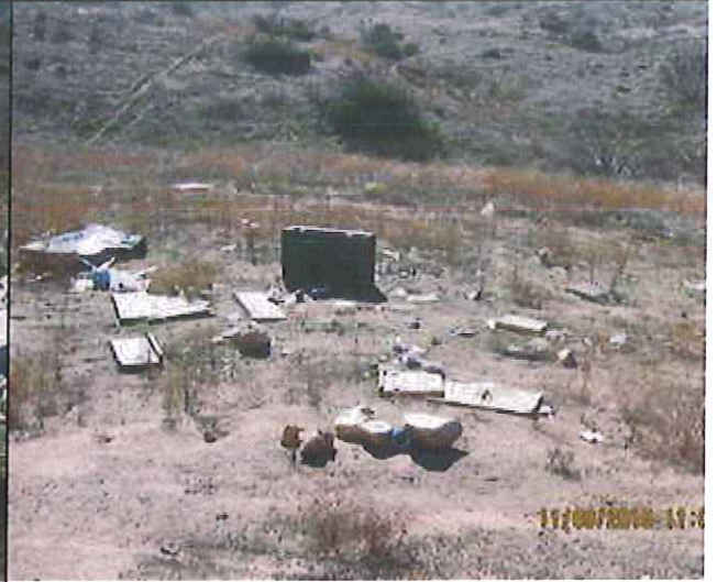
2 110310 TMcMullen