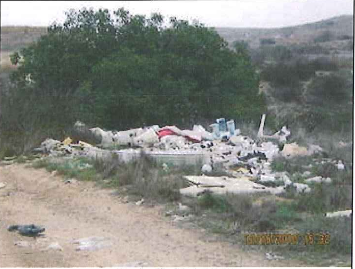
Trash pile #1. JCRUZ