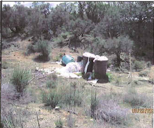
AMeza FU 03232011