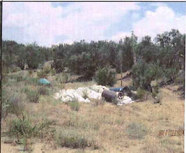
AMeza 07/07/2011 Violation Remains the sa