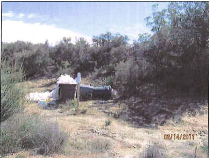
AMeza FU 02142011