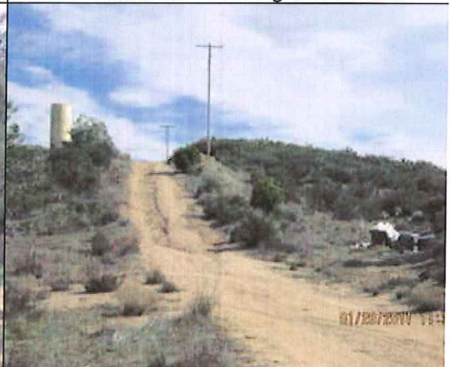
AMEza FU 01262011