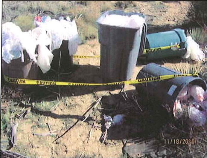
B Pollard 111810 AR