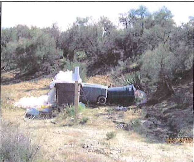
AMeza FU 02142011