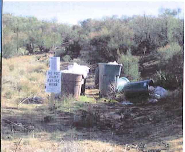
ABustillos - Posting of NOV-ARE