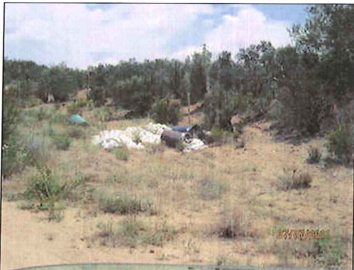
AMEza 07/07/2011 Violation Remains the same