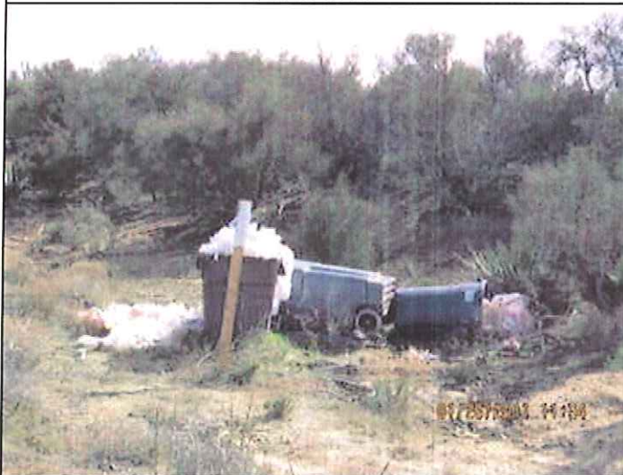
AMEza FU 01262011