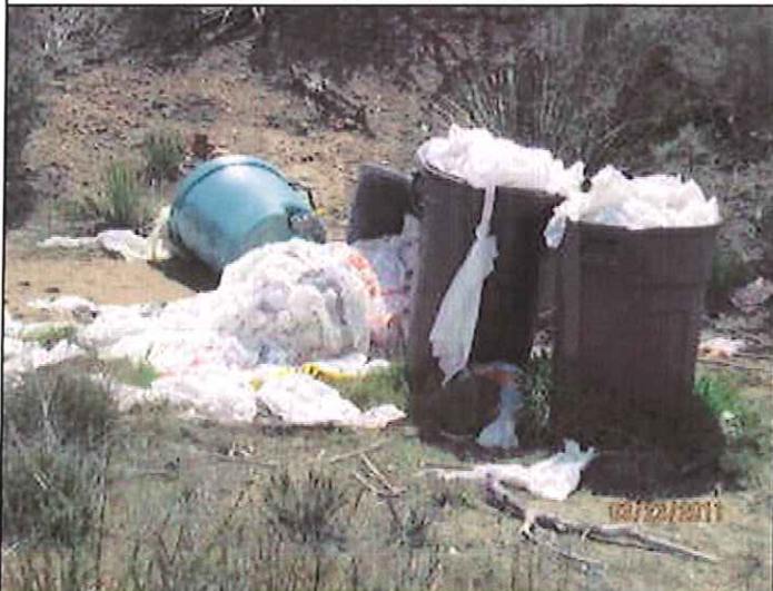
AMeza FU 03232011