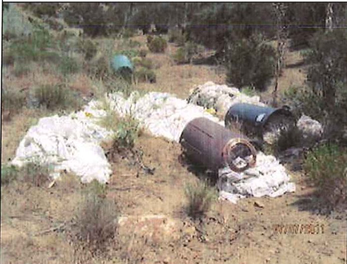
AMeza 07/07/2011 Violation Remains the same