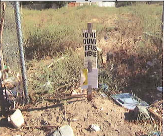
Photo taken from the right of way