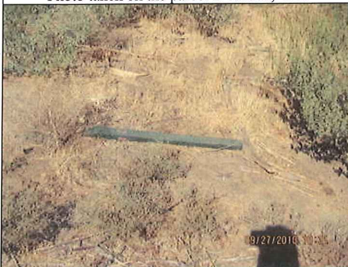
Photo taken on the parcel D Jurden, CET