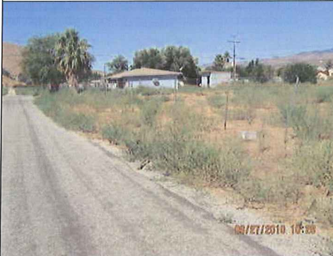
Photo taken from the right of way