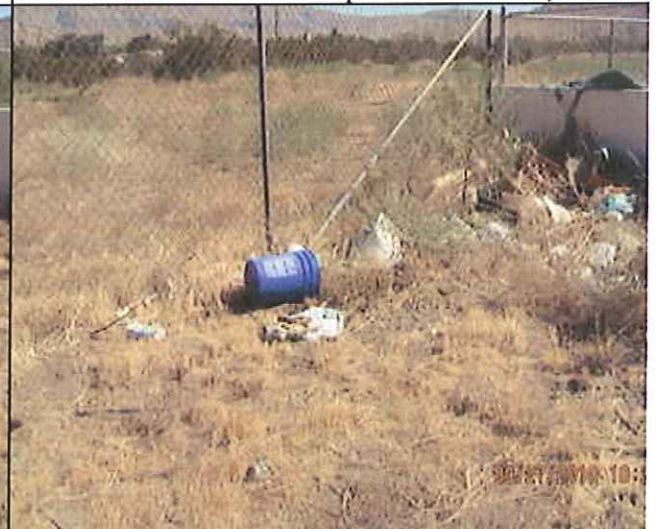
Photo taken on the parcel D Jurden, CET