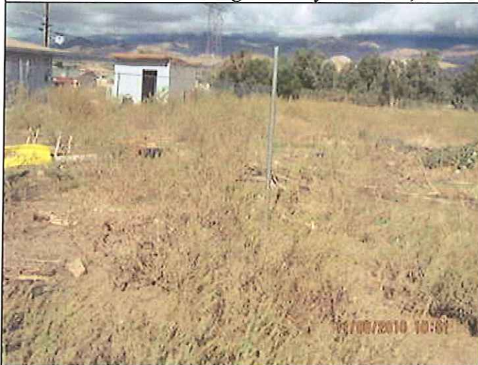
Photo taken on the parcel D Jurden, CET