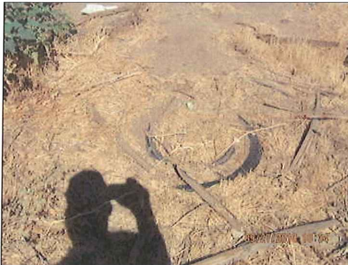
Photo taken on the parcel D Jurden, CET