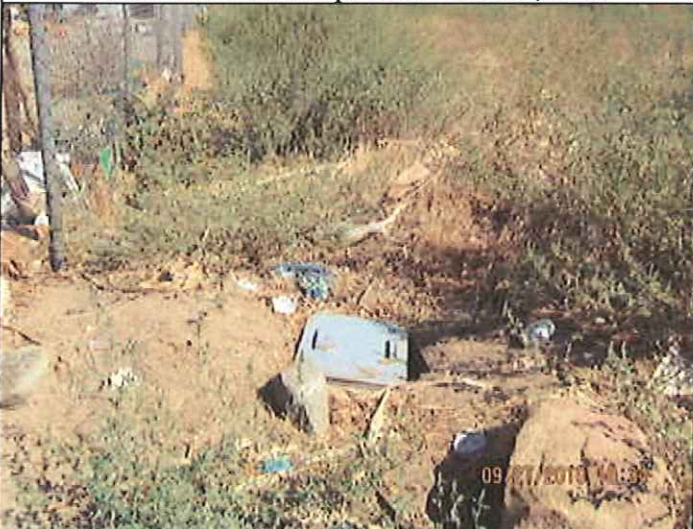
Photo taken from the right of way