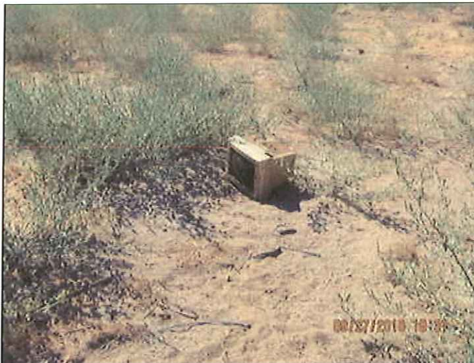
Photo taken on the parcel