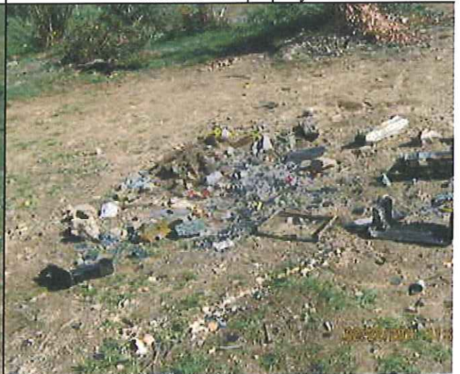
Accumulated rubbish on property. JCRUZ