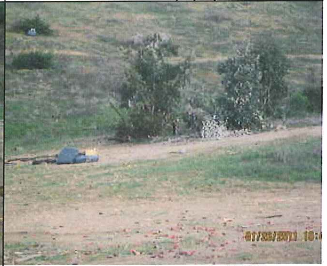
Rubbish on the property.