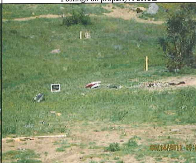
Rubbish continues to be on the property. JCRUZ