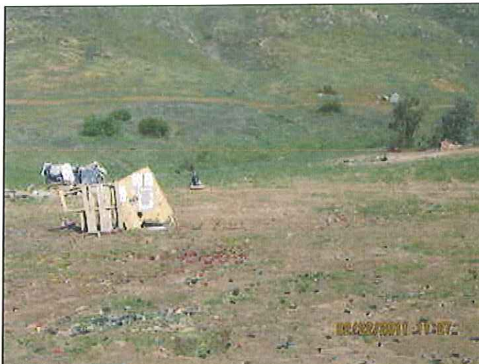
Rubbish on property.