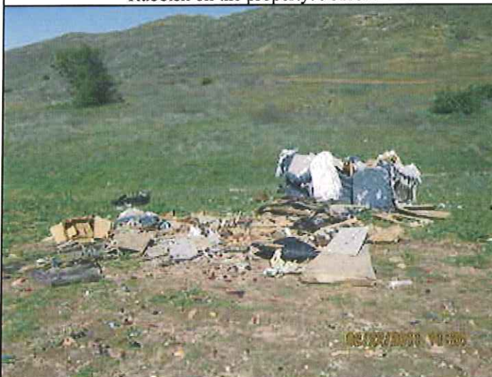
Accumulated Rubbish on property. JCRUZ