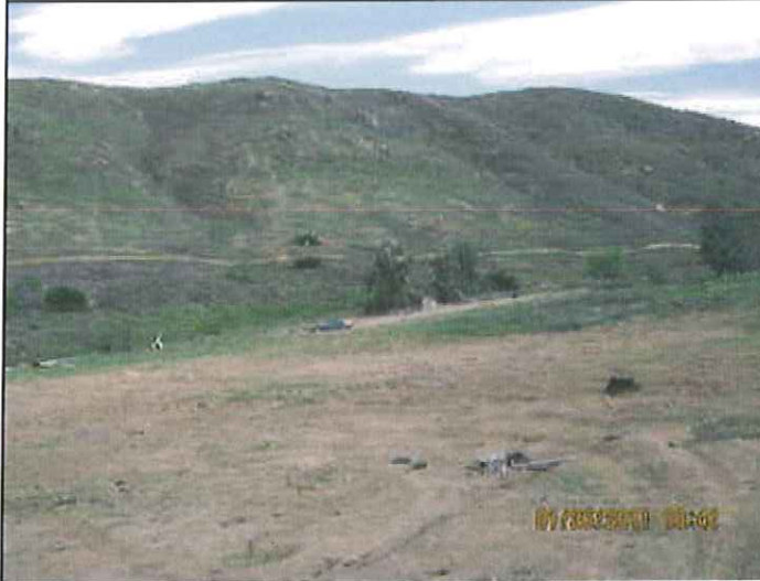
Rubbish on the property.