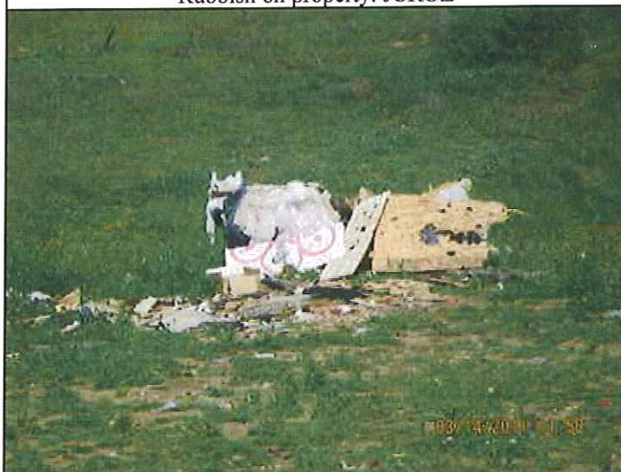
Rubbish continues to be on the property. JCRUZ