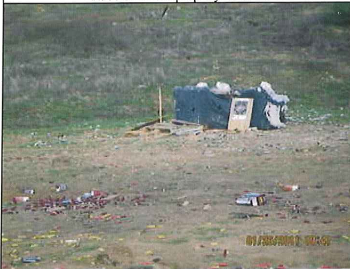
Rubbish on the property.