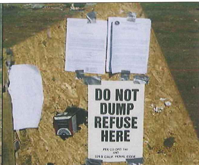
Postings on property. JCRUZ