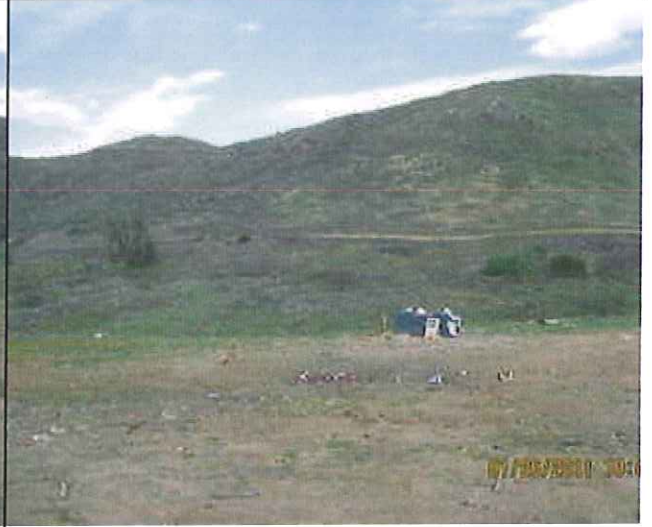
Rubbish on the property.