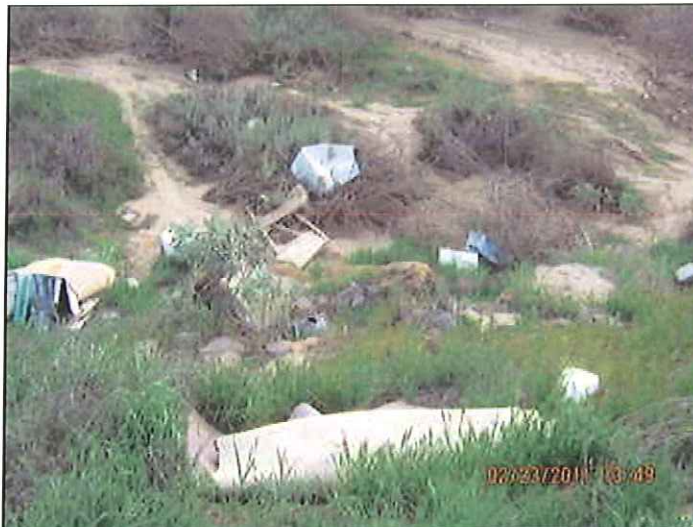
Photo taken from the right of way