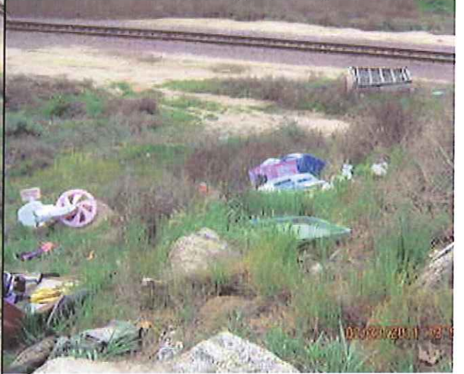
Photo taken from the right of way