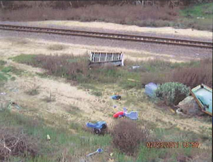
Photo taken from the right of way