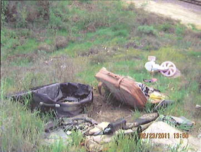
Photo taken from the right of way