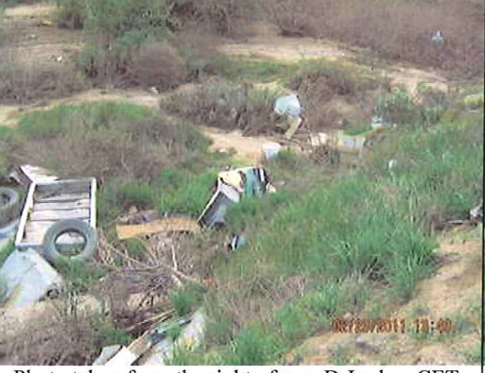
Photo taken from the right of way