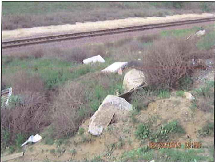
Photo taken from the right of way