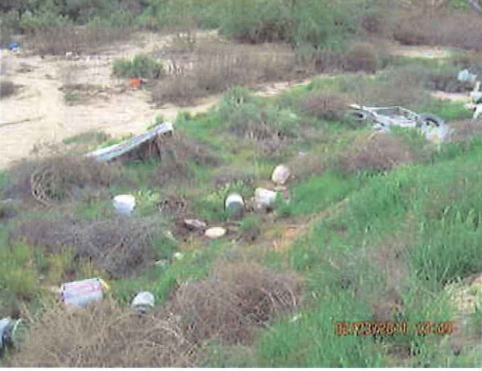
Photo taken from the right of way