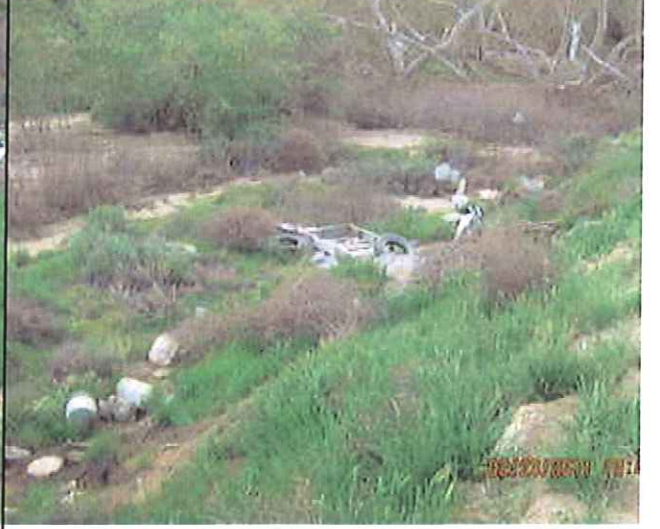
Photo taken from the right of way