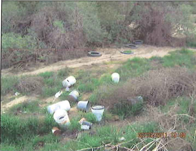
Photo taken from the right of way