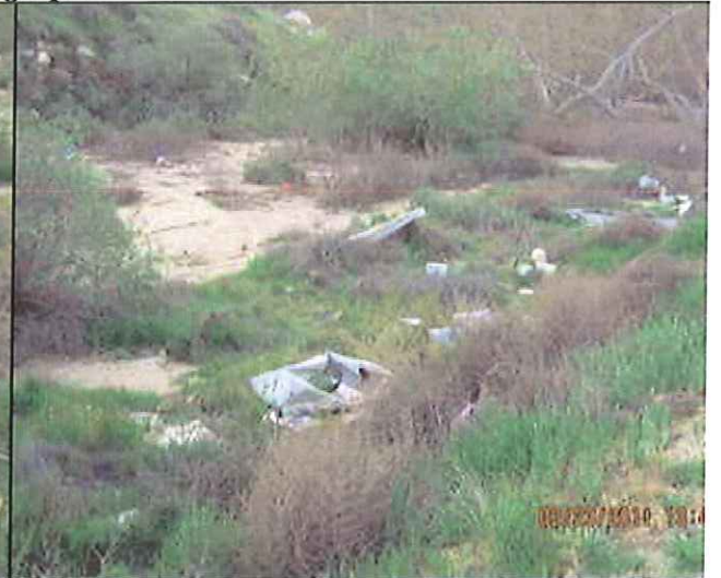
Photo taken from the right of way