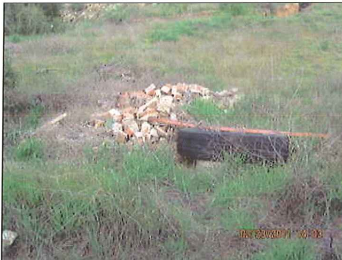
Photo taken on the parcel D Jurden, CET