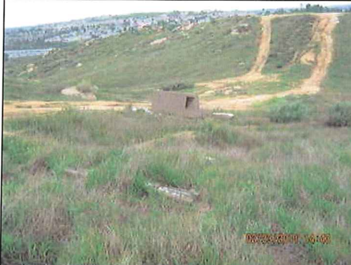
Photo taken on the parcel D Jurden, CET